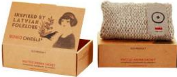
knitted sachet 15 cm x H 9 cm available in 3 aromas

- Collection “Folklore” is a pure cooperation with Latvian crafts masterminds where clay pots are hand made with the best traditions considered. The same with the knitted sachets that are hand made by Latvian crafts masters.