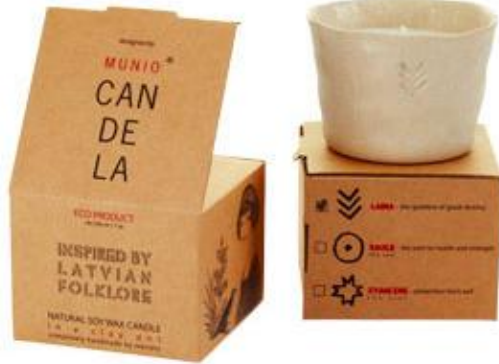
clay pot Ø 9 cm x H 7 cm – net 200 ml – burn time 30 h available in 3 aromas